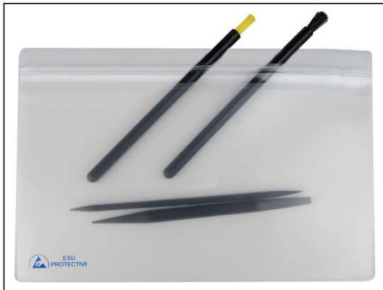
34458 with brush tools and probes (not included)

"It should be understood that any object, item, material or person could be a source of static electricity in the work environment. Removal of unnecessary nonconductors, replacing nonconductive materials with dissipative or conductive materials and grounding all conductors are the principle methods of controlling static electricity in the workplace, regardless of the activity." [ESD Handbook ESD TR20.20-2008 section 2.4 Sources of Static Electricity]