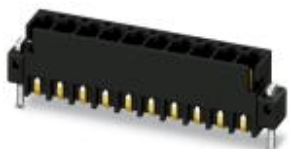
The figure shows the 10-position version

PCB headers, nominal current: 6 A, rated voltage (III/2): 160 V, number of positions: 7, pitch: 2.54 mm, color: black, contact surface: Gold, mounting: SMD soldering, Fixed coding of the first position, can be combined with the FMC 0,5/...-ST-2,54 C1 connector