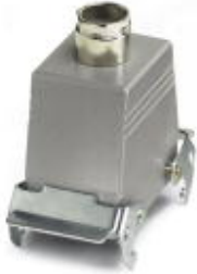
The illustration shows version HC-D 50-TFQ-76/M 1 PG 21 G

Sleeve housing, with double locking latch, height 76 mm, with screw connection, 1x Pg29, straight cable entry