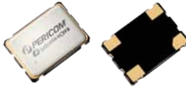
7.0 x 5.0mm Ceramic SMD