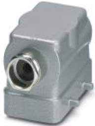
HEAVYCON B10 sleeve housing, for double locking latch, height: 56 mm, with 1 x Pg16 screw connection, lateral cable outlet

Please be informed that the data shown in this PDF Document is generated from our Online Catalog. Please find the complete data in the user's documentation. Our General Terms of Use for Downloads are valid ( http://phoenixcontact.com/download )