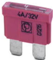
Flat-type plug-in fuse, type C, color code: pink, nominal current: 4 A

Please be informed that the data shown in this PDF Document is generated from our Online Catalog. Please find the complete data in the user's documentation. Our General Terms of Use for Downloads are valid ( http://phoenixcontact.com/download )