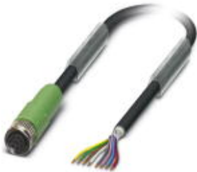
Sensor/Actuator cable, 8-position, PUR, Black RAL 9005, shielded, Free cable end, on Socket straight M8, Cable length: 3 m

Please be informed that the data shown in this PDF Document is generated from our Online Catalog. Please find the complete data in the user's documentation. Our General Terms of Use for Downloads are valid ( http://download.phoenixcontact.com )