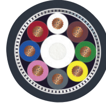
PUR halogen-free black shielded [PUR]