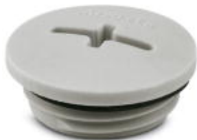
Screw plug, cable gland material: PA, PA, connecting thread: M25 x 1.5, color: lightgrey RAL 7035, with O-ring

Please be informed that the data shown in this PDF Document is generated from our Online Catalog. Please find the complete data in the user's documentation. Our General Terms of Use for Downloads are valid ( http://phoenixcontact.com/download )