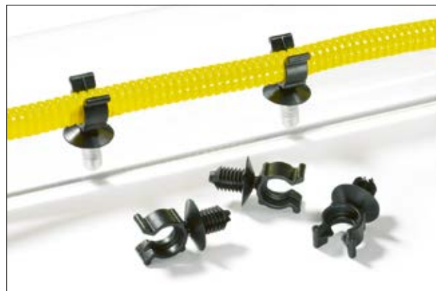
The tubing clips into the CTC clamp and is held firmly.