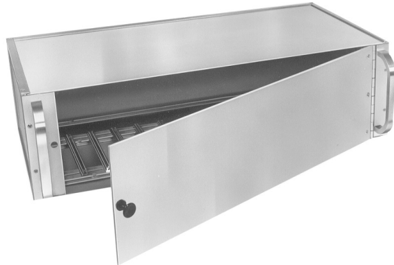
Rack with HFP52-1 Hinged Front Panel (side)