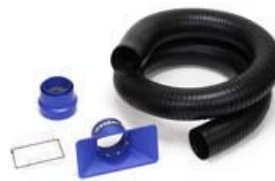
C1571 Duct Kit