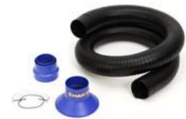
C1572 Duct Kit