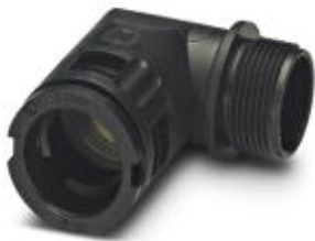
Cable gland, metric thread, IP68/69k protection, angled

Please be informed that the data shown in this PDF Document is generated from our Online Catalog. Please find the complete data in the user's documentation. Our General Terms of Use for Downloads are valid ( http://phoenixcontact.com/download )