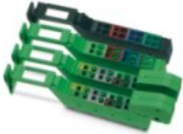
Connector set for Inline bus coupler, color-coded

Please be informed that the data shown in this PDF Document is generated from our Online Catalog. Please find the complete data in the user's documentation. Our General Terms of Use for Downloads are valid ( http://phoenixcontact.com/download )