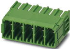
The figure shows a 5-pos. version of the product

Header, Nominal current: 41 A, Rated voltage (III/2): 630 V, Number of positions: 4, Pitch: 7.62 mm, Color: green, Contact surface: Tin, Assembly: Soldering