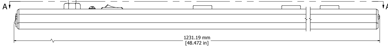
ASSEMBLY - VIEW FROM SIDE