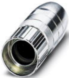
Sleeve housing for cable connector, straight, Screw locking, M23, Shielded: Yes, Cable cross section: 10 mm...14 mm

Please be informed that the data shown in this PDF Document is generated from our Online Catalog. Please find the complete data in the user's documentation. Our General Terms of Use for Downloads are valid ( http://download.phoenixcontact.com )