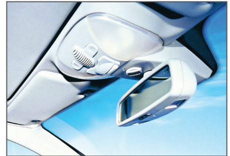
Interior lighting consoles