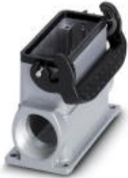
The figure shows box mounting bases without protective covers

Box mounting base, with single locking latch, height 84 mm, with a support 1x PG29, with a protective cover