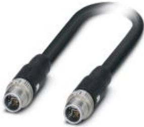
Assembled Ethernet cable, CAT5e, shielded, 8-wire, 4 x 26 AWG (data) and 4 x 20 AWG (power), RAL 9005 (black), M12 hybrid plug to M12 hybrid plug, length: 5.0 m

Please be informed that the data shown in this PDF Document is generated from our Online Catalog. Please find the complete data in the user's documentation. Our General Terms of Use for Downloads are valid ( http://download.phoenixcontact.com )