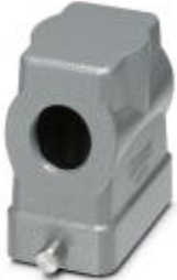
HEAVYCON sleeve housing B10, for single locking latch, height 72 mm, with thread 1x M20, lateral conductor exit

Please be informed that the data shown in this PDF Document is generated from our Online Catalog. Please find the complete data in the user's documentation. Our General Terms of Use for Downloads are valid ( http://download.phoenixcontact.com )