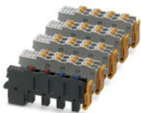
Axioline F connector set (for e.g., AXL F DI32/1 1F)

Please be informed that the data shown in this PDF Document is generated from our Online Catalog. Please find the complete data in the user's documentation. Our General Terms of Use for Downloads are valid ( http://phoenixcontact.com/download )