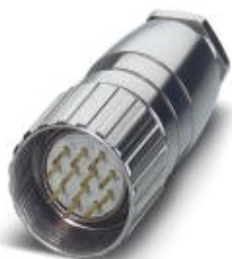
Cable connector, with Pg11 connection thread, straight, shielded: no, Screw locking, M23, No. of pos.: 16, type of contact: Pin, Solder connection, cable diameter range: 8 mm ... 12 mm

Please be informed that the data shown in this PDF Document is generated from our Online Catalog. Please find the complete data in the user's documentation. Our General Terms of Use for Downloads are valid ( http://phoenixcontact.com/download )