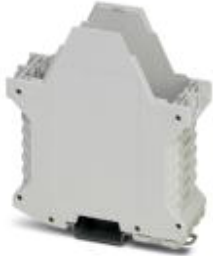
Component housing without vents, Lower part, Cross connection: DIN rail bus connector, Color: light gray, Width: 35 mm, Constructional height: 114.5 mm, Number of positions cross connector: 5

Please be informed that the data shown in this PDF Document is generated from our Online Catalog. Please find the complete data in the user's documentation. Our General Terms of Use for Downloads are valid ( http://phoenixcontact.com/download )