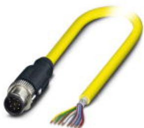
Sensor/Actuator cable, 8-position, PVC, yellow, shielded, Plug straight M12 SPEEDCON, A-coded, on free cable end, Cable length: 2 m

Please be informed that the data shown in this PDF Document is generated from our Online Catalog. Please find the complete data in the user's documentation. Our General Terms of Use for Downloads are valid ( http://phoenixcontact.com/download )