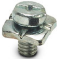
PE screw, for HC-HS contact inserts

Please be informed that the data shown in this PDF Document is generated from our Online Catalog. Please find the complete data in the user's documentation. Our General Terms of Use for Downloads are valid ( http://download.phoenixcontact.com )